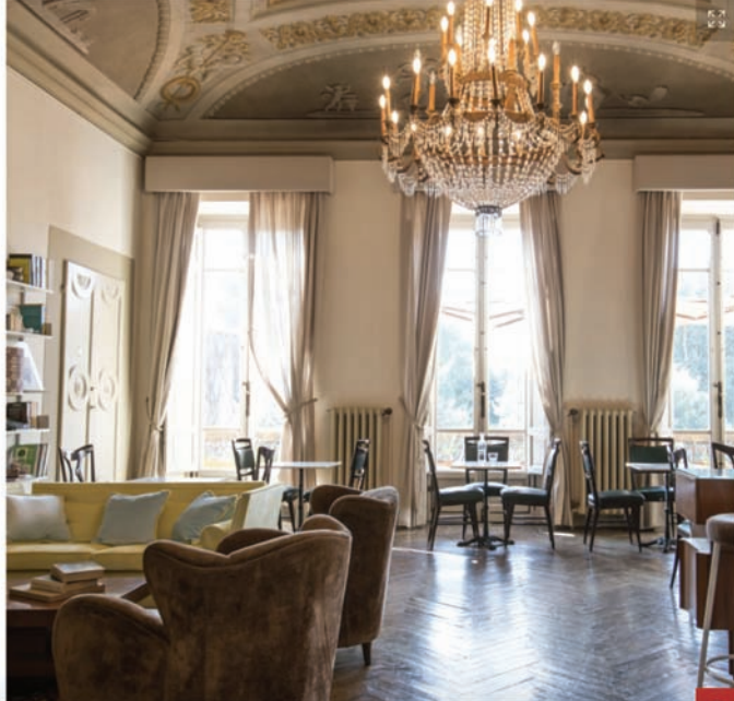
The Salon at AdAstra