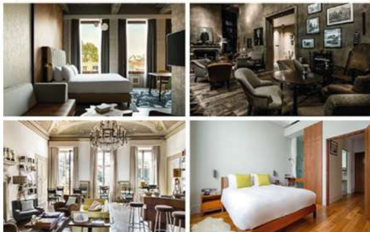
Ad Astra Florence, Italy

From Florence to Rotterdam – where to stay for a chic minibreak on the Continent this autumn